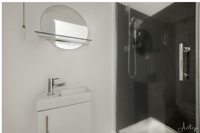
Ensuite 8'5 x 2'6 (2.57m x 0.76m)

White sink unit with low level w/c, shower unit with black tiles and spotlights to the ceiling.