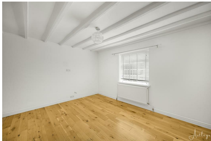
Bedroom 1 12'7 x 10'3 (3.84m x 3.12m)

leading from the dressing area with a step down to bedroom with solid oak flooring, spotlights to the ceiling, Window to the back, beamed ceiling and radiator.