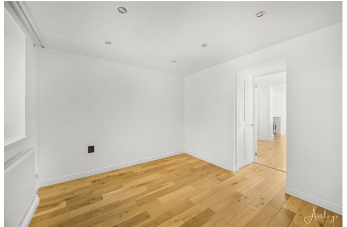
Second reception room 12'6 x 11' (3.81m x 3.35m)

Front lounge with solid oak flooring, spotlights to the ceiling, window to the front and radiator.