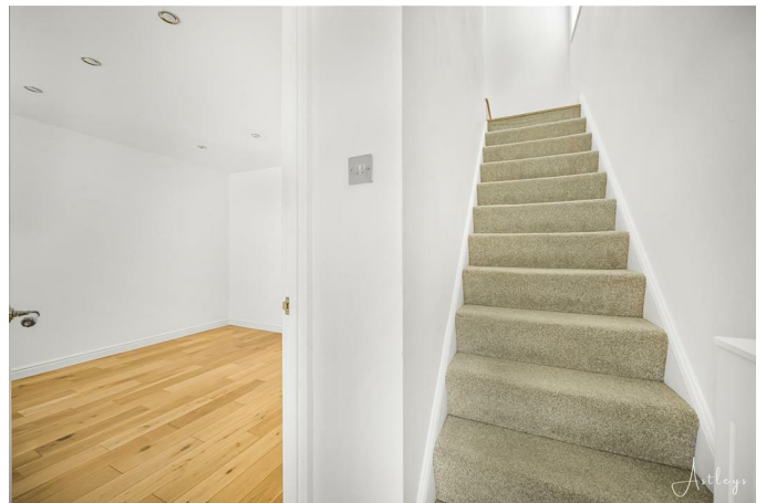
Entrance hallway/stairs 2'8 x 2'10 (0.81m x 0.86m)

Composite front door into hallway with radiator and door into second lounge.