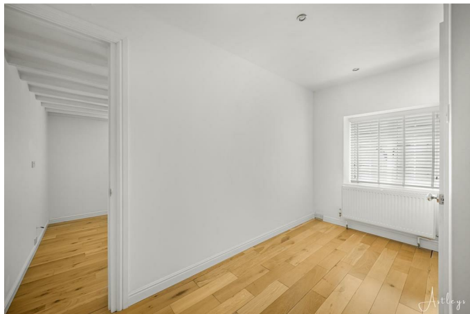
Dressing area 12'3 x 11'5 (3.73m x 3.48m)

Solid oak flooring, inbuilt wardrobes/storage, oak flooring and window to side.